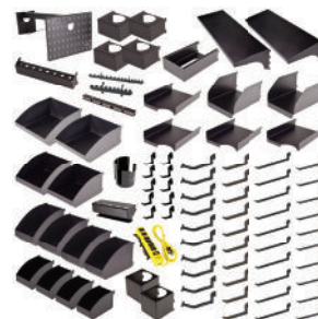
85 Piece Workbench Accessory Kit (sold separately)