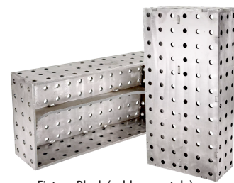
Fixture Block (sold separately)